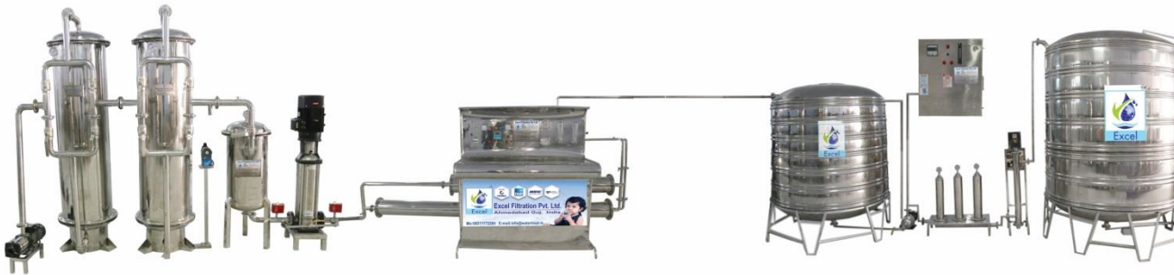
MINERAL WATER PLANT