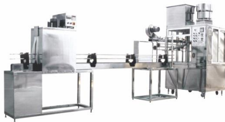
BOTTLE FILLING MACHINE