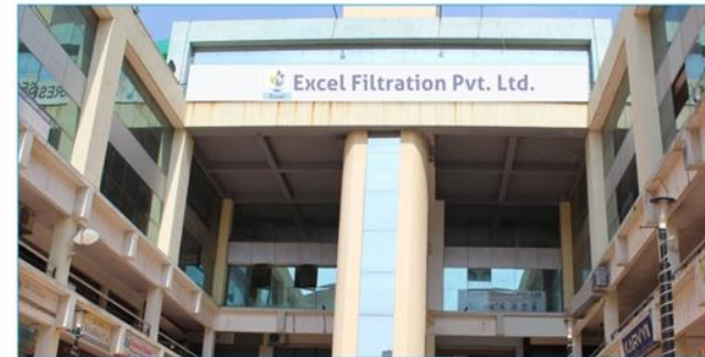
City Corporate Office