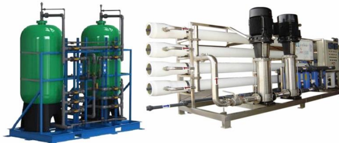
INDUSTRIAL RO PLANT