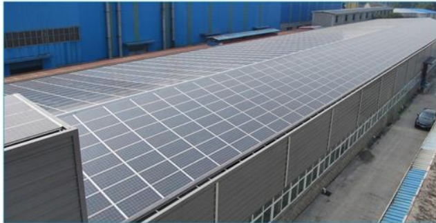
Our Humble Beginning