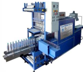
GROUP SHRINK MACHINE